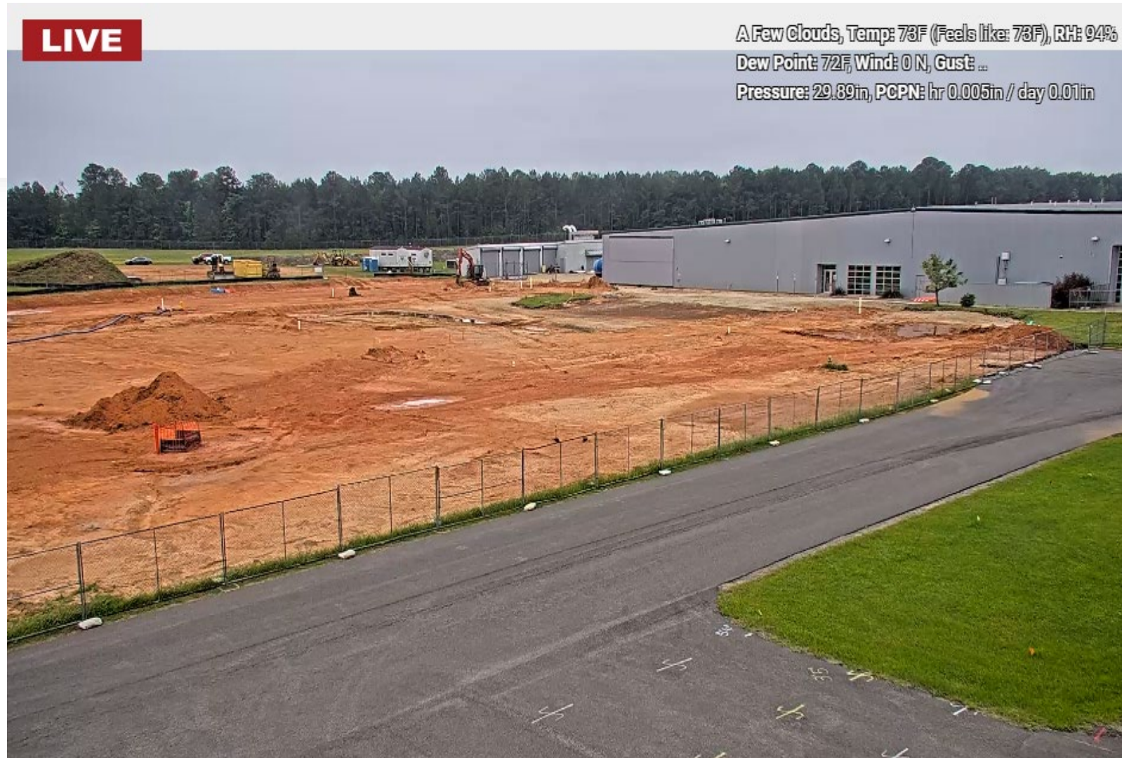
Site as Pictured 04.29.2026