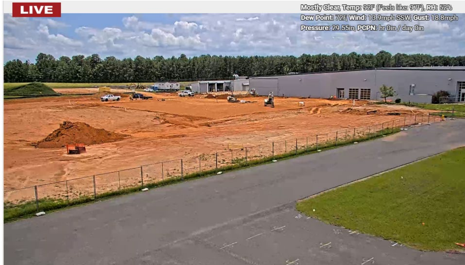
Site as Pictured 06.10.2026