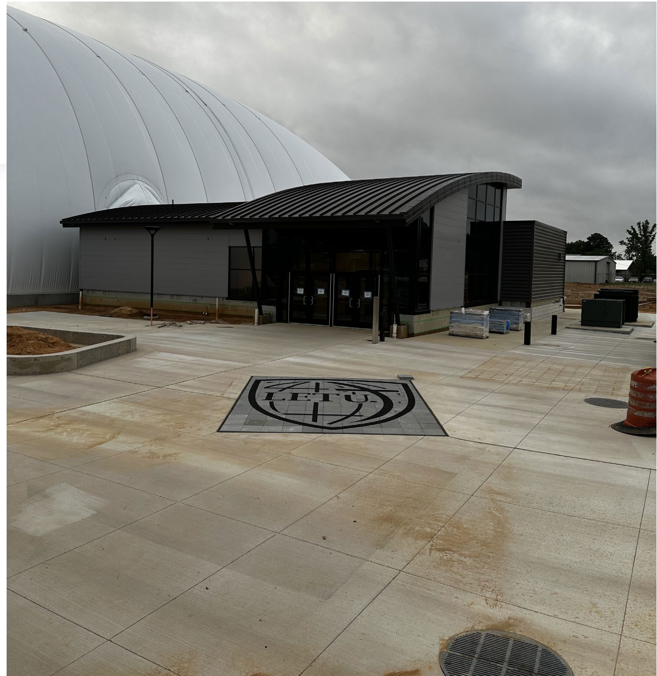
Site as Pictured 04.22.2026