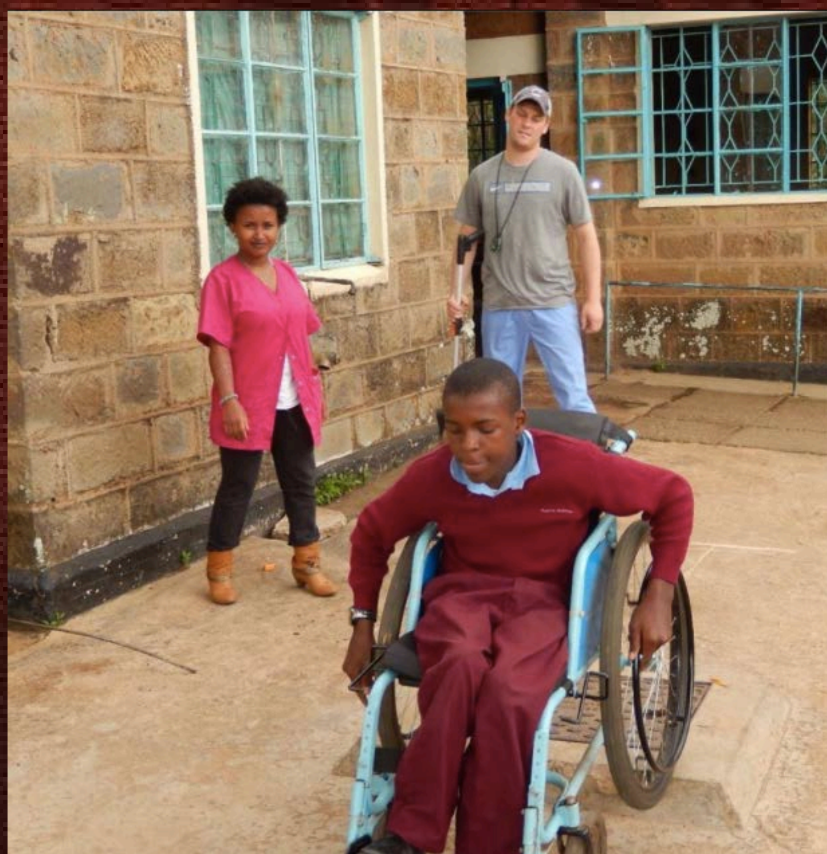
Figure 1. Curb study test being conducted in Kenya with a student from the school. Tests were conducted by a member of our team and a translator.